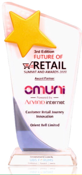
Customer Retail Journey Innovation Winners Future of Retail Summit & Awards 2020