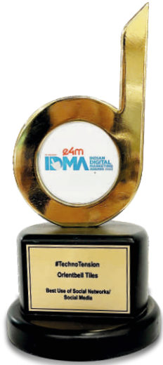
Indian Digital Marketing 2023 Best use of social media