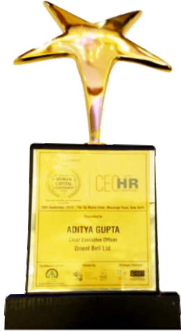
CEO with HR Orientation ZEE BUSINESS National Human Capital Leadership Congress & Awards