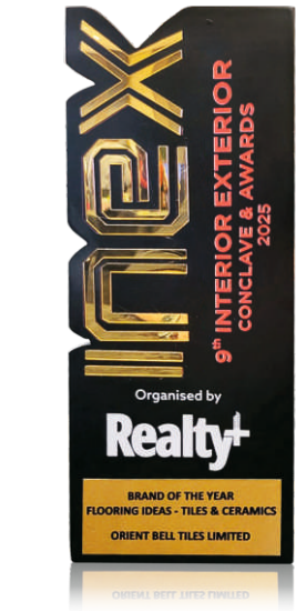
Brand of The Year 2025 (Flooring Idea-Tiles & Ceramic)

Realty+ recognizes the best of the best within the ranks of Indian Real Estate