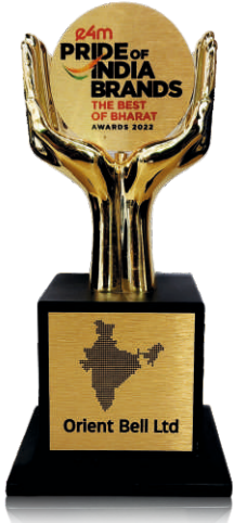
e4m Pride of India Brands 2022 (The Best Of Bharat Conference & Awards)