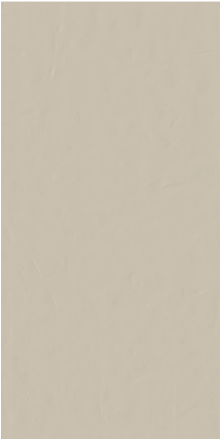
MINT FROST UNICOLOUR SOFTPUNCH